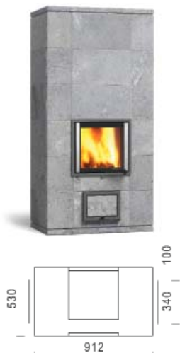
HESTIA SOLO 180