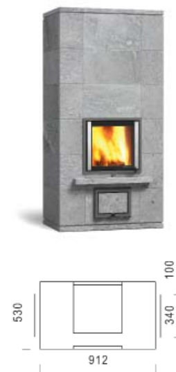
HESTIA SOLO 180-1